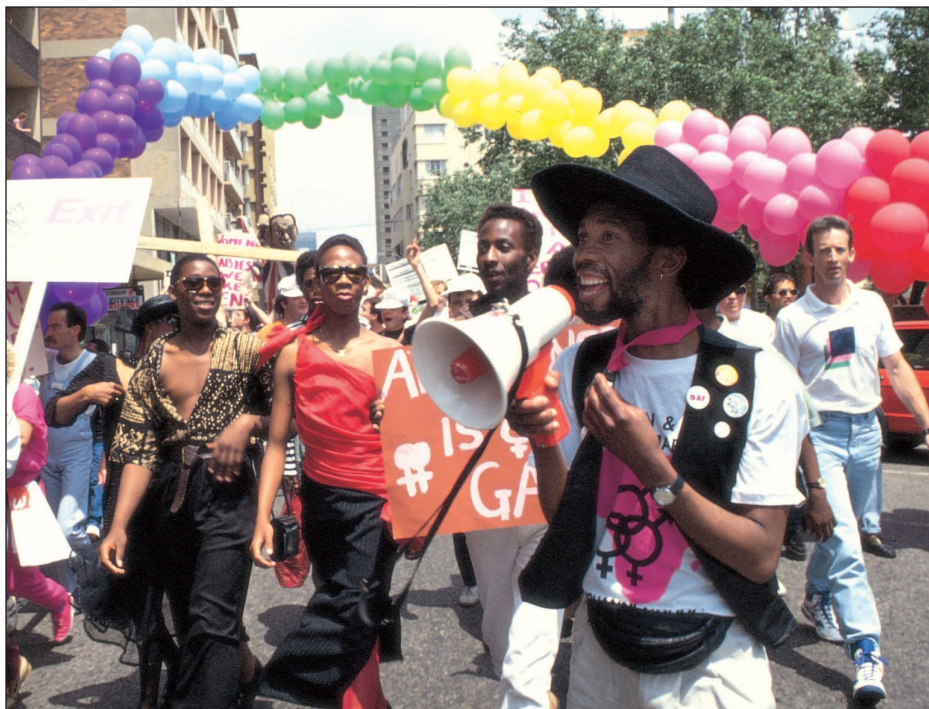
Simon Nkoli leads the 1991 gay Pride march

jail in 1988 he founded a new organisation, the Gay and Lesbian Organisation of the Witwatersrand. GLOW was non-racial and openly aligned with the struggle against apartheid by its affiliation with the UDF, and became the public face of the fight for gay rights at a time when negotiations for a new South Africa were underway.